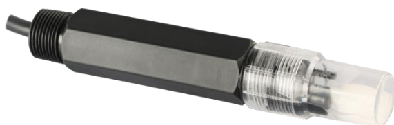
Dissolved Oxygen Sensor (Non-replaceable membrane head)