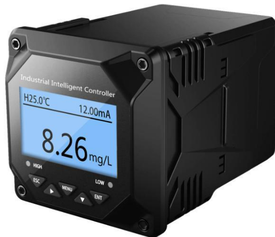
DM2800 Dissolved Oxygen meter

DM2800 Dissolved oxygen meter Measuring principle The oxygen molecules diffused through the membrane are reduced to hydroxide ions ( \text{OH}^- ) at the cathode. Silver is oxidized to silver ions ( \text{Ag}^+ ) at the anode (this forms a silver halogenide layer). A current flows due to the electron donation at the cathode and the electron acceptance at the anode. Under constant conditions, this flow is proportional to the oxygen content of the medium. This current is converted in the transmitter and indicated on the display as an oxygen concentration in \text{mg/L} , \mu\text{g/L} , or \text{Vol}\% , as a saturation index in \% SAT or as an oxygen partial pressure in \text{hPa} .