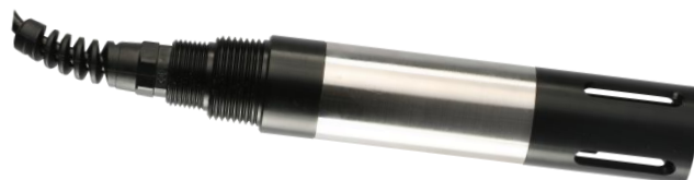
Dissolved Oxygen Sensor (Replaceable membrane head)